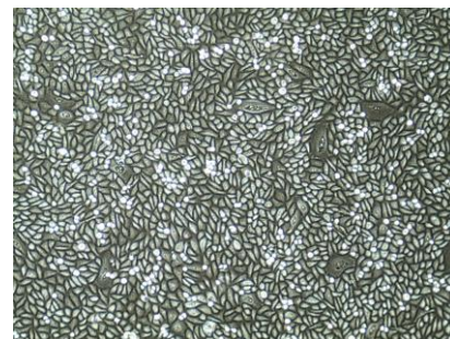
Neonatal Keratinocytes, 10x

Lifeline’s HEK are not exposed to antimicrobials or phenol red when cultured in the respective Lifeline® medium. Lifeline offers antimicrobials and phenol red; however they are not required for eukaryotic cell proliferation. A vial of Gentamicin and Amphotericin B (GA; LS-1104) is provided with the purchase of DermaLife K (LL-0007), or DermaLife K Calcium-Free (LL-0029) Medium Complete Kits for your convenience. The use of GA is recommended to inhibit potential fungal or bacterial contamination of eukaryotic cell cultures. Phenol Red (LS-1009) may be purchased, but is not required.